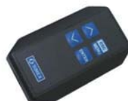
IR remote controller SIR-15